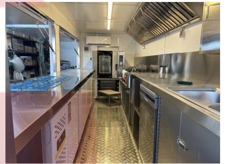
- Inside -