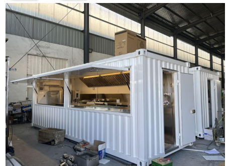
- Production -