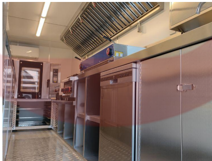
- Kitchen Equipment -