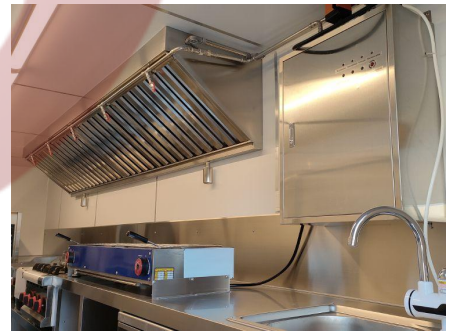
- Kitchen Equipment -