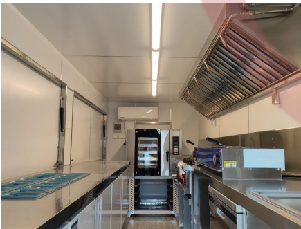
- Inside -