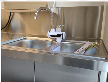
- Sink -